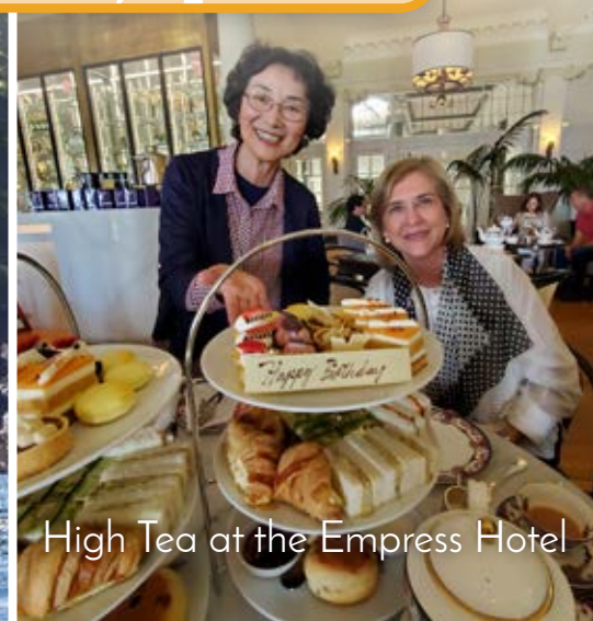
High Tea at the Empress Hotel