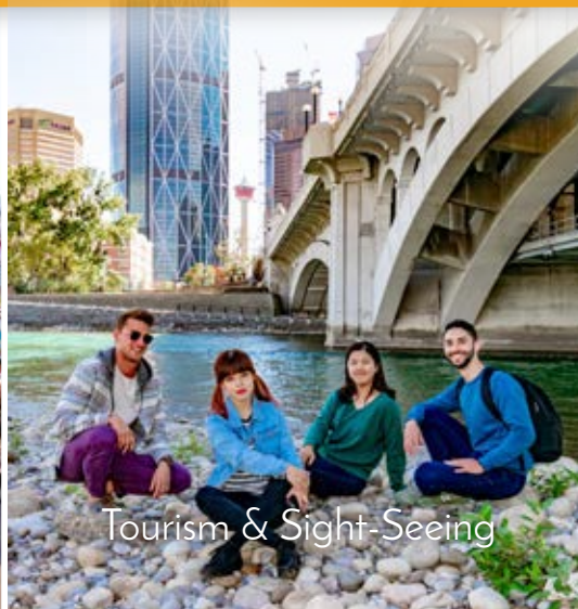
Tourism & Sight-Seeing