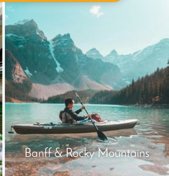
Banff & Rocky Mountains