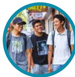
Distance to school: 35-45 Minutes

Breakfast and bag lunch provided, and dinner served with the family (three meals provided)