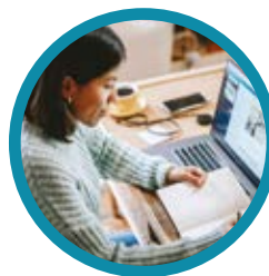
Private room with a desk