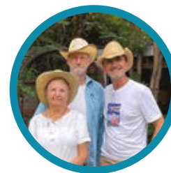
Our families are a reflection of Canada - Multicultural!

Visit the Accommodation section of our website to learn more about life with GV homestay families!